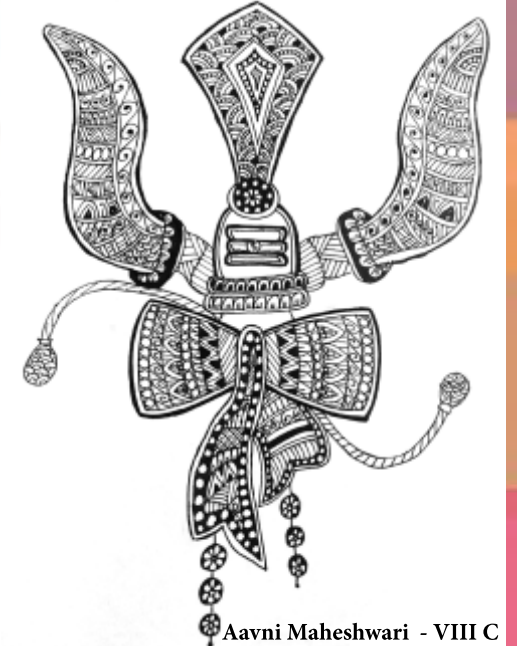
Aavni Maheshwari - VIII C