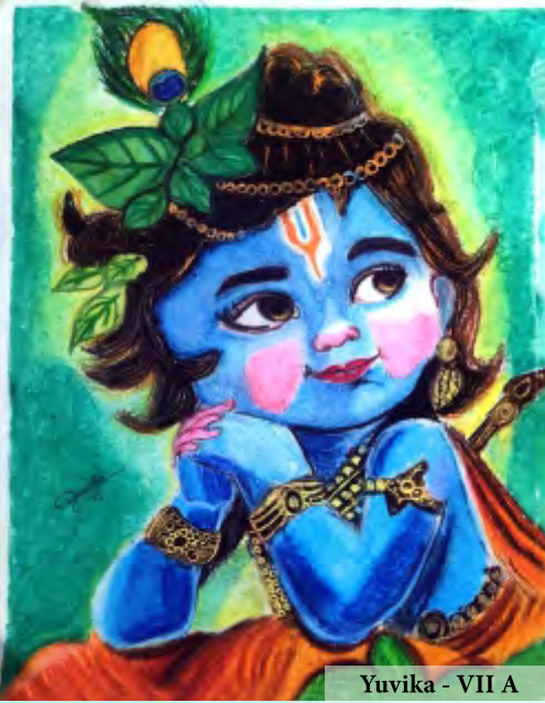
Yuvika - VII A