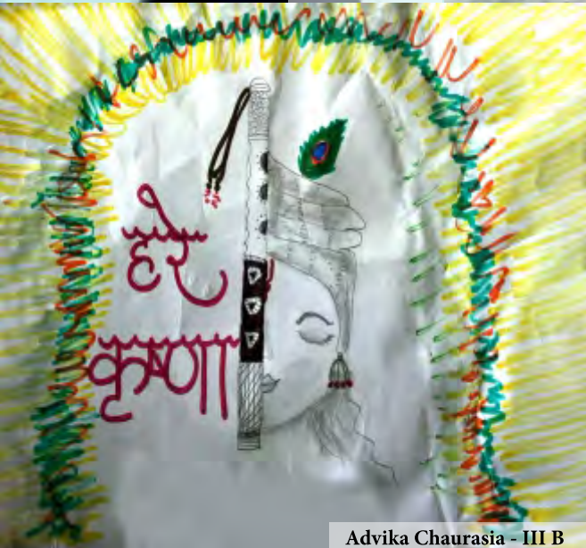
Advika Chaurasia - III B