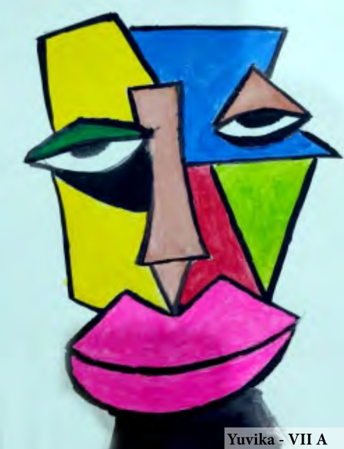
Yuvika - VII A