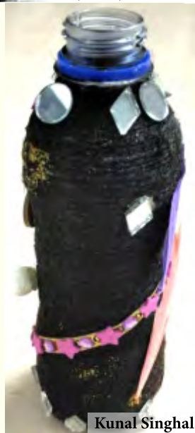
Kunal Singhal - III C