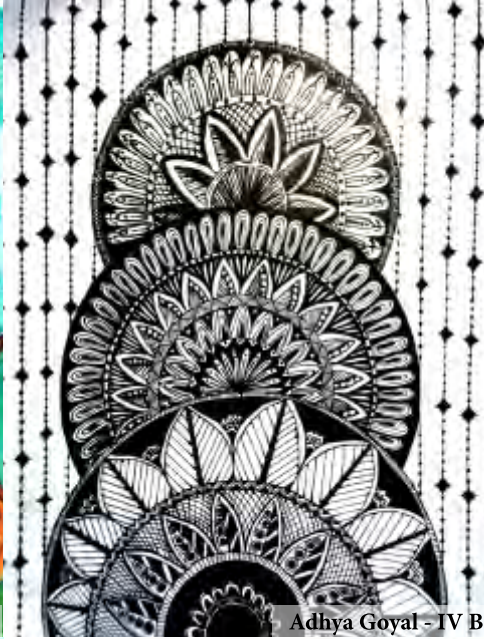
Adhya Goyal - IV B