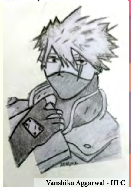
Vanshika Aggarwal - III C